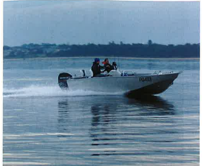
See you on the water, we'll be the ones weighed down with fish ...