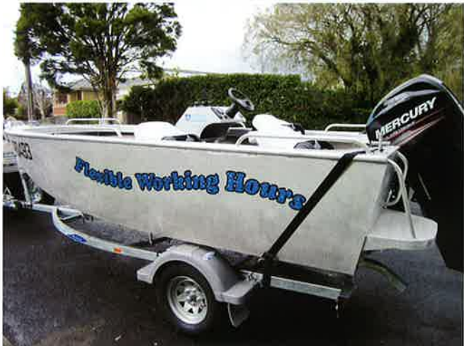
Plate Alloy Australia Pty Ltd is based in Cheltenham: John Pontifex runs week-long intensive boat building courses five times per year. Students come from all over the world to be taught to weld aluminium and how to build their own boats.

Plate Alloy has a range of more than 60 boat kits. Boat building course dates and kit details can be found at Plate Alloy's website: www.platealloy.com