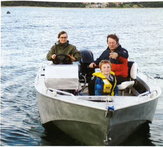
And finally the name - thanks Dave!