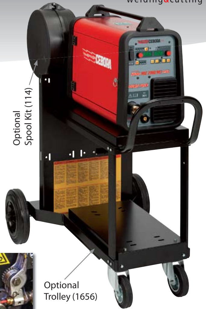
Optional Spool Kit (114)